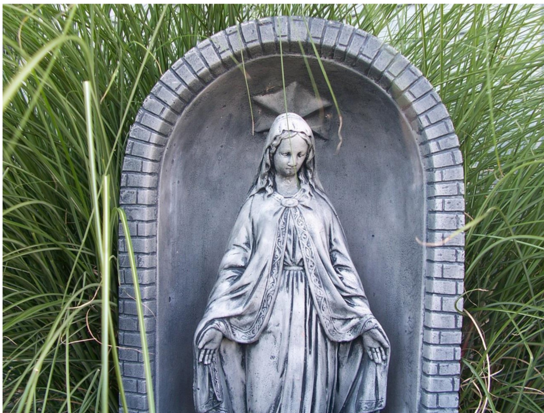
Our Lady Star of the Sea